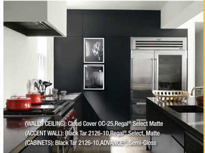
(WALLS/CEILING): Cloud Cover OC-25, Regal® Select Matte (ACCENT WALL): Black Tar 2126-10, Regal® Select, Matte (CABINETS): Black Tar 2126-10, ADVANCE™ Semi-Gloss