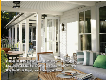
(SIDING/COLUMNS): Cloud Cover OC-25, Regal® Select Exterior (Low Lustre/CEILING) Flat (DOORS) Soft Gloss (WINDOW TRIM) Gray Owl OC-52, Regal, Select Exterior/Soft Gloss

Each CertaPro Painters® business is independently owned and operated. Lic# WC-15781-H04